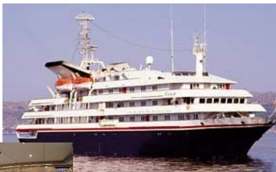
ANCHORS DOWN: The Clelia II (above), equipped with a luxury lounge (left) and other amenities, docks on the Sault Ste. Marie waterfront 12 times this summer.

This promotion has attracted other cruise ships to Sault Ste. Marie in the past, including the 500-passenger MS Columbus. More familiarization tours are taking place this summer, with the goal of drawing additional cruise vessels to the Great Lakes over the next few years.