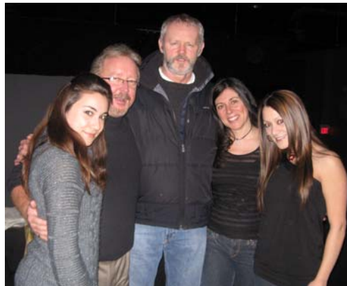
LEFT: Actor David Morse (middle), who has appeared in The Green Mile and Contact , with the Tourism Sault Ste. Marie crew. TSSM helped attract DViant Films to the Sault, where the production company just finished shooting Long-fellow, featuring Morse.