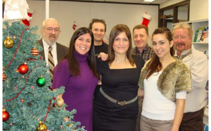
TOP: Members of the EDC team with some guests at the organization's annual open house event.